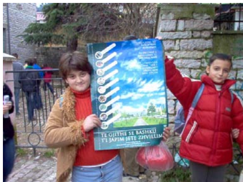
Children and MDGs!

Clean' on December 10 th . Almost 2500 students coming from all the secondary and high schools of Gjirokaster have been mobilized to clean the school's surroundings every day and put garbage in the nearest waste collection place. The activity started at 12 am and, after cleaning the territory of their schools, all the children and students went