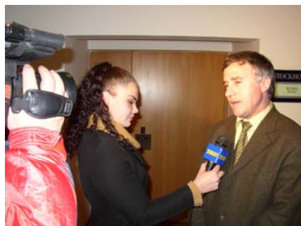
The author, Z. Dervishi

By containing documents, analyses and interpretations, the book will help not only to overcome the post-communist prejudices on volunteerism in Albanian society, but will also support the promotion of volunteerism and will serve as referee point for media, academics, students, future researches and studies, government structures, UN bodies and other international organizations active in Albania.