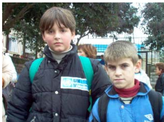
Young volunteers in Gjirokaster

The contribution of volunteers and young people is of paramount importance in meeting the challenges that the Millennium Development Goals represent. As Mr. Mark Malloch Brown, Administrator of UNDP , notes 'vital to the success of getting the MDGs on track now is civil society mobilization, where young people in particular have a critical role to play. Young people not only represent the future, they are also a rich source of the kinds of innovative solutions needed to address some of the most pressing problems facing us today. As such, young people have the potential to be a powerful force as advocates for the MDGs and agents for change in their societies, and already, thousands of young people, in the North and South alike, are showing what is possible in the fight against global poverty in their own communities and across borders' .