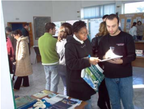
The NGOs Fair

UNV in Fier organized the 'NGO fair' to bring together the different NGOs working in the region. The main objective has been to favor information share and peer exchange concerning the activities and projects carried on by the NGOs.