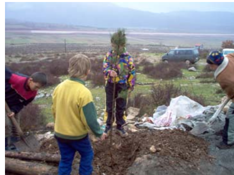
Volunteers working for territory maintenance and plant of trees