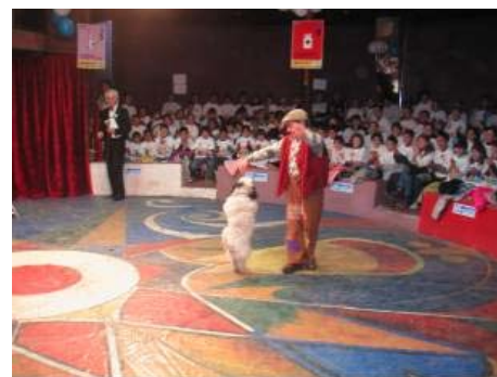
The dogs performance

The event was also attended by representatives from the UN, the Municipality of Tirana and the Ministry of Youth, Culture and Sport. The private sector – PEPSI – also participated in the project by providing free drinks and snacks that were offered to all the children at the end of the show.