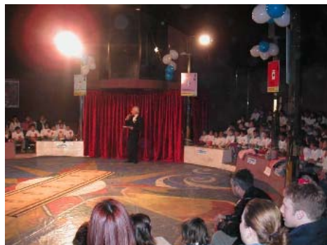
The Circus show

UNV, along with the Circus of Tirana, the Albanian Youth Council, and the NGOs MJAFT! and VIS have used the power of the Circus to bring the Millennium Development Goals (MDGs) closer to the children of Albania. The MDGs and the concept of volunteerism were promoted amongst children by organizing Circus Show. Skits of clowns, trapeze artists, magicians and dogs were voluntarily performed by more than 20 professional Albanian artists who are part of the historical tradition of the Albanian Circus. Between the many different performances, an MDG Fairy Tale was told to 200 children coming from orphanage houses ways to achieve the MDGs in Albania.