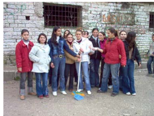
A cleaning team...

kaster have sage be-organized hind the ac- the activity tivity: the 'Gjirokaster importance